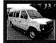
2009 Ford E250 Wheelchair Van Medical Transport Ambulette For Wheelchair Mobility ADA Handicapped