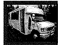
2008 Ford E450 Wheelchair Shuttle Bus For Wheelchair Mobility ADA Handicapped