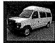
2009 Ford E250 High Top Medical Transport Van Bus For Wheelchair Mobility ADA Handicapped