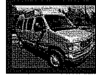
2007 Ford E250 High Top Van Medical Transport Ambulette Bus Mobility ADA Handicapped Lift