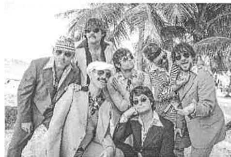
Yacht Rock Revue